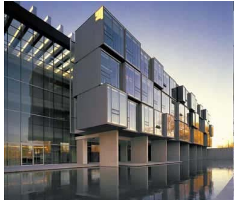
The Perimeter Institute, Waterloo

An enabling " Institutional Thickness ": CTT, Communitech, Prosperity Council, Waterloo Research and Technology Park, Tamarack/Lutherwood Community, WRIEN, Digital Media Corridor